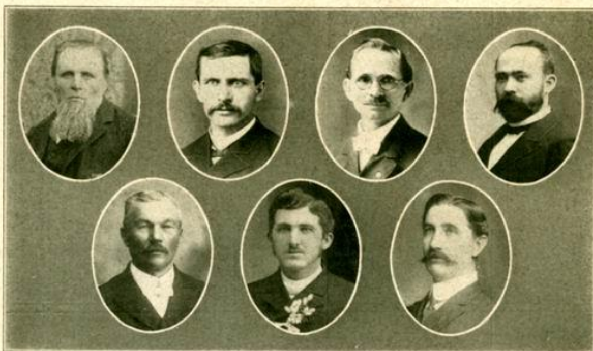
Group of Pastors