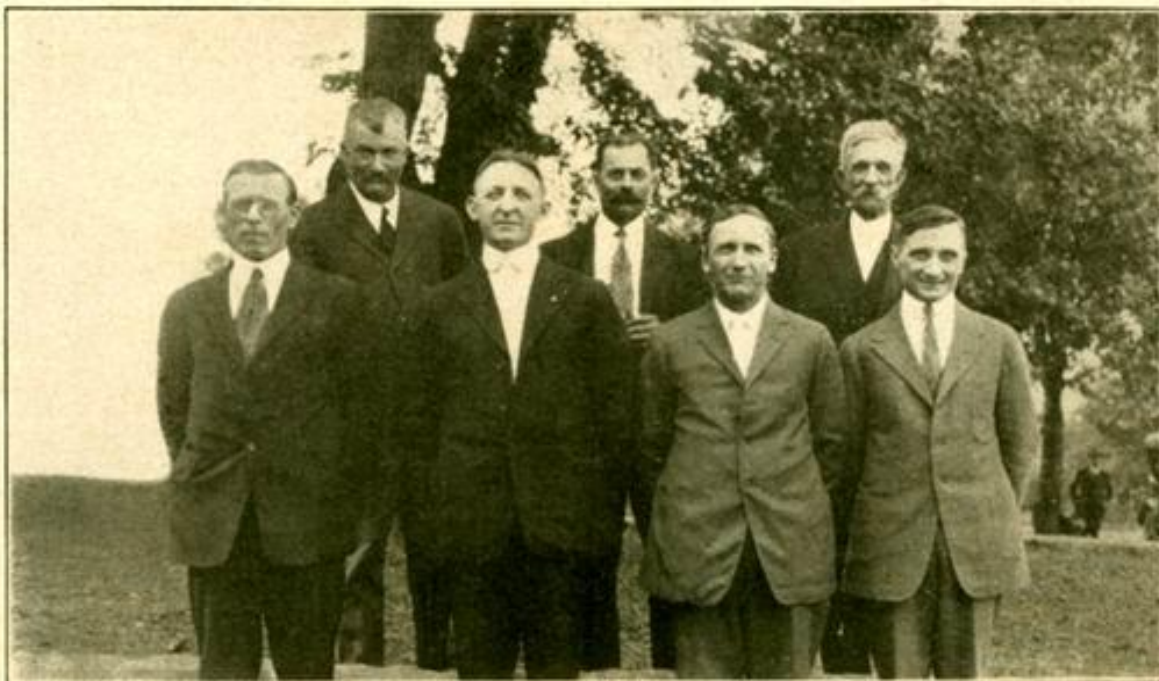
TRUSTEES AND BUILDING COMMITTEE, 1919-1920