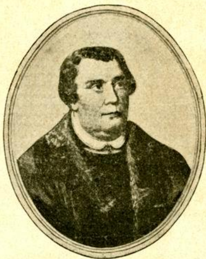
DR. MARTIN LUTHER