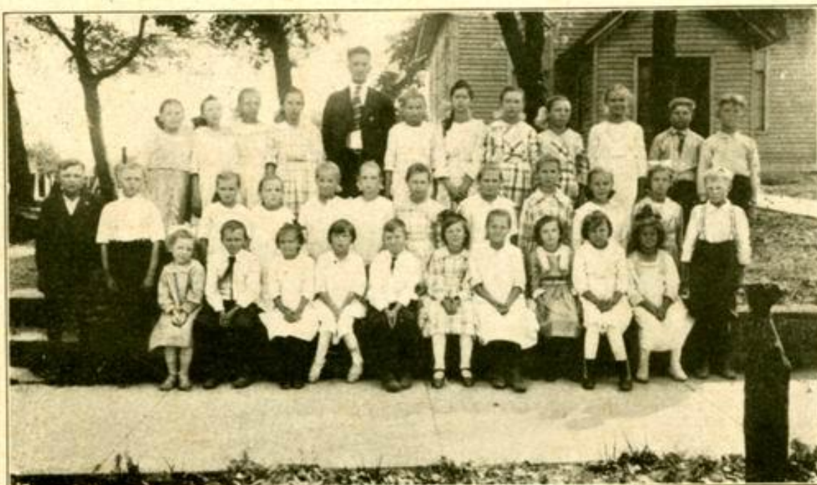
Pupils of Ev. Lutheran St. Peter's School