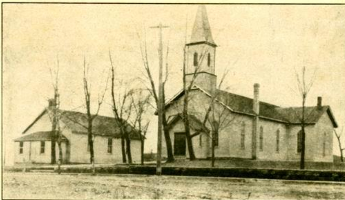
Old School Built 1893