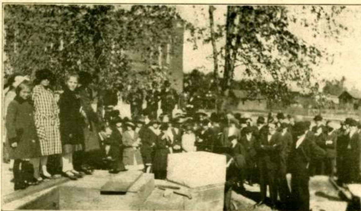
LAYING OF CORNERSTONE, OCTOBER 12, 1919