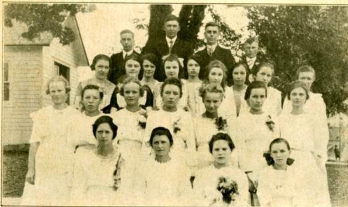
Sunday School Class—(Christenlehre)